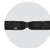
Anterior Pelvic Belts

Spex is as diligent as possible in compiling this information. Information is correct at time of printing/release: 28/05/24. For questions concerning our products, their specifications and their utilisation please refer to the instruction manual and/or a product consultant of Spex. Product specifications are subject to change without notice. © Spex 2024